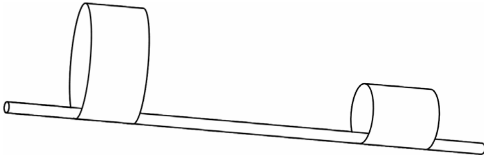
FIG 1. Straw glider paper airplane used in this lab. Each “wing” is made of a strip of paper taped in a circle to the straw “fuselage.”